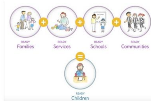
THE SCHOOL READINESS EQUATION

https://www.ecia.org.au/Transition-to-School